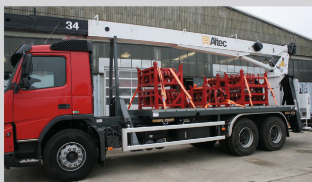
Cran Truck with Platform and Iron Racks