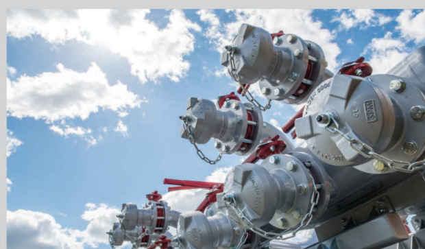
Various manifold configurations