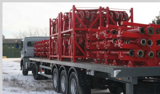
Costumized Flat Bed Trailer with Iron Racks