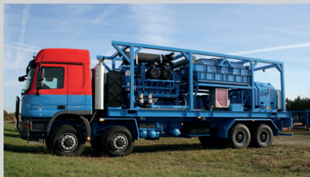
Skid on Truck Frac Pump