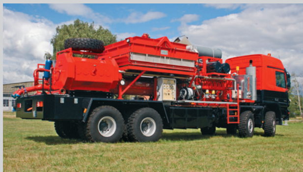
Truck Mounted Frac Pump