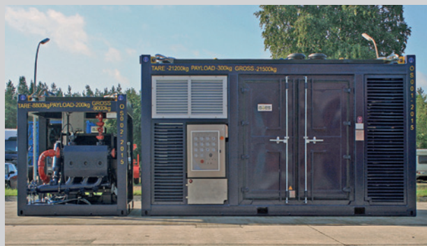
Frac Pump Skids (DNV certified)