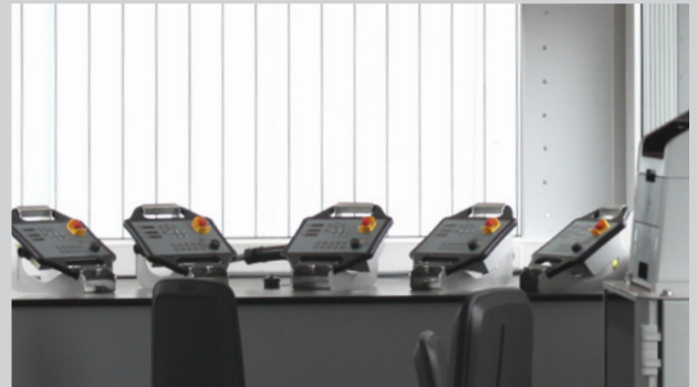
Frac Pump Remote Controls