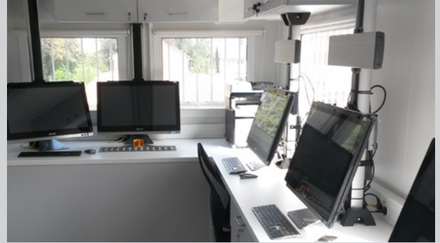
Touch Screen Frac Pump, Blender, CAS and Hydration Unit Controls