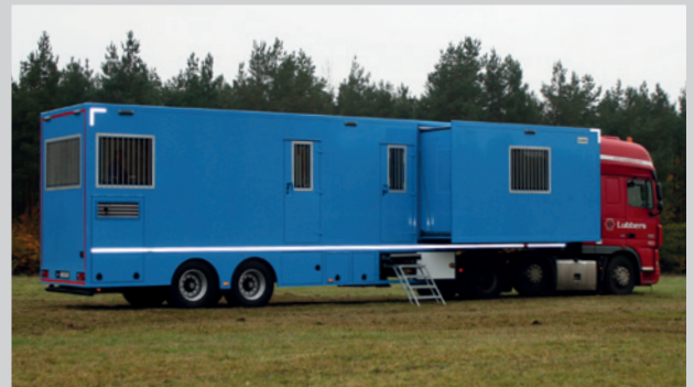
Trailer Mounted Data Van with Slide-Out