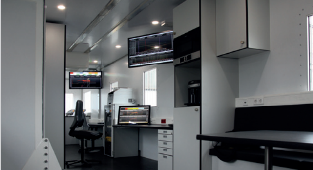
Typical Inside View